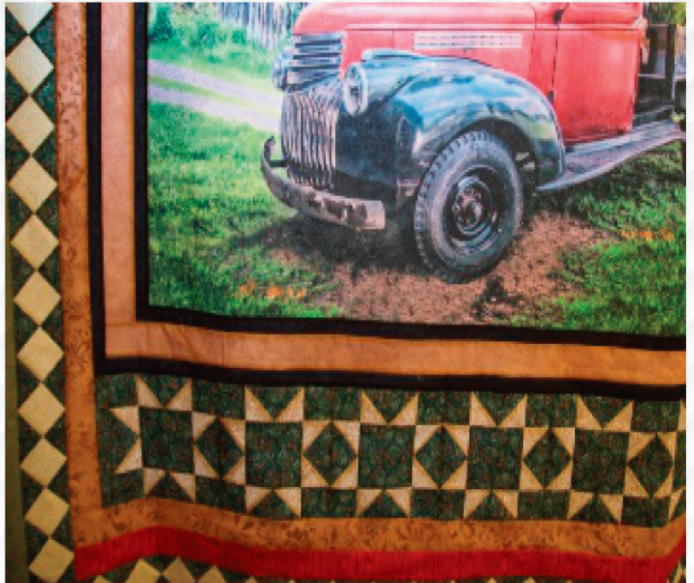
Red Pickup Quilt piecing detail

We are investigating the possibility of having both a live and an on-line auction simultaneously. Many other aspects of this event are being developed, and details will be forthcoming including the exact date and location of the event.