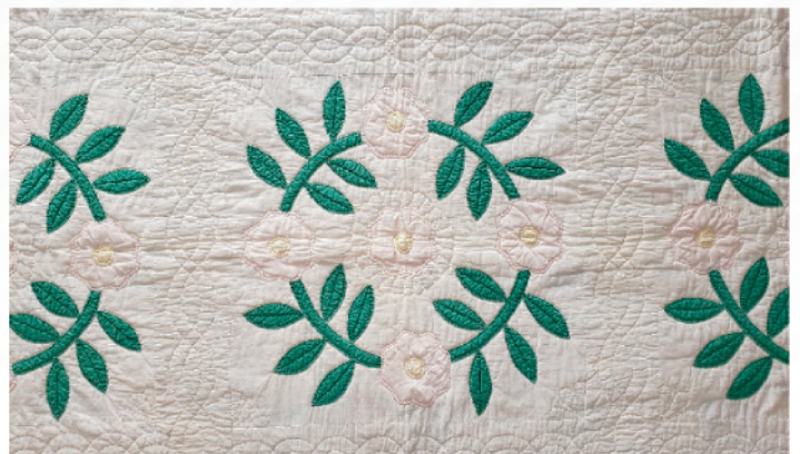
Wreath quilt block detail