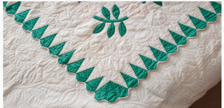
Detail of ice cream cone border