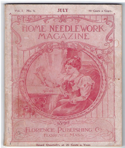
Cover of 1899 Home Needlework Magazine

People have been using a myriad of hand-stitches for centuries, quilters among them. The photo below shows the cover of the July 1899 issue of Home Needlework Magazine. This magazine was published four times a year and a year-long subscription cost 25 cents. Some of the articles covered were titled “The Story of Some Famous Laces”, “Centerpieces and Doilies” and “Inexpensive Midsummer Gowns”.